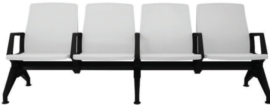
FORD - FOUR SEATER