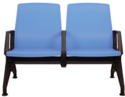
FORD - TWO SEATER