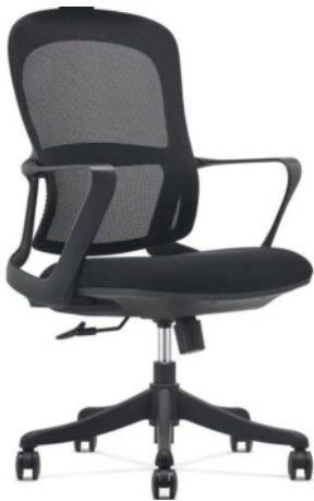
MOBOX - BLACK