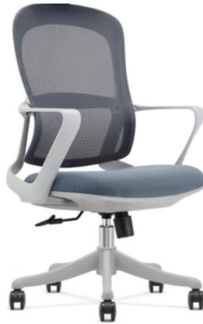
MOBOX - GREY