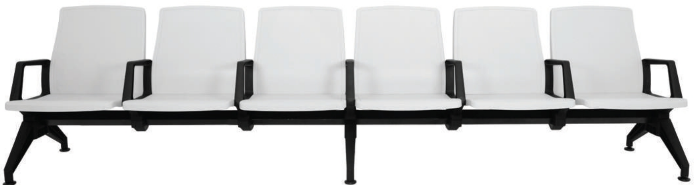
FORD - SIX SEATER