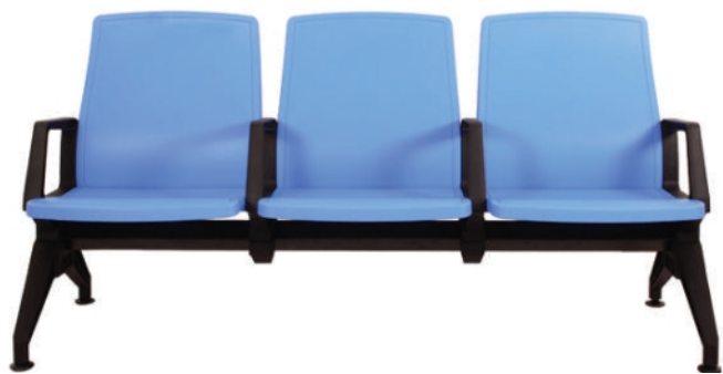
FORD - THREE SEATER