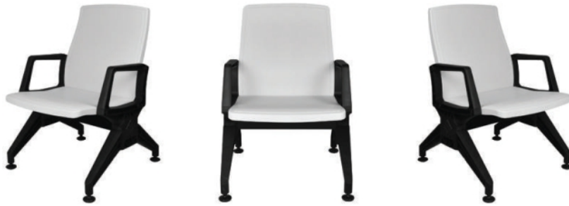
FORD - SINGLE SEATER